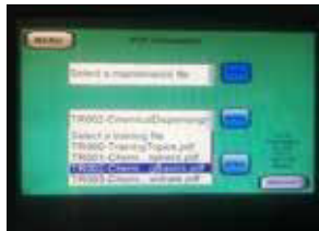
SAMPLE TRAINING FILES COME WITH SYSTEM