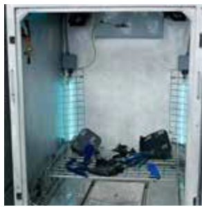
PARTS CLEANING UV ONLY