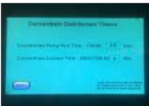
PROGRAMMING CHANGES FOR NEW DISINFECTANT