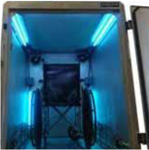
UV LAMPS ON FOR DISINFECTION

VISIT HUBSCRUB.COM FOR CONTENT, MODELS, OPTIONS AND ACCESSORIES