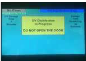
UV IN PROGRESS