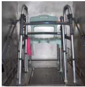
MULTIPLE TYPES OF EQUIPMENT